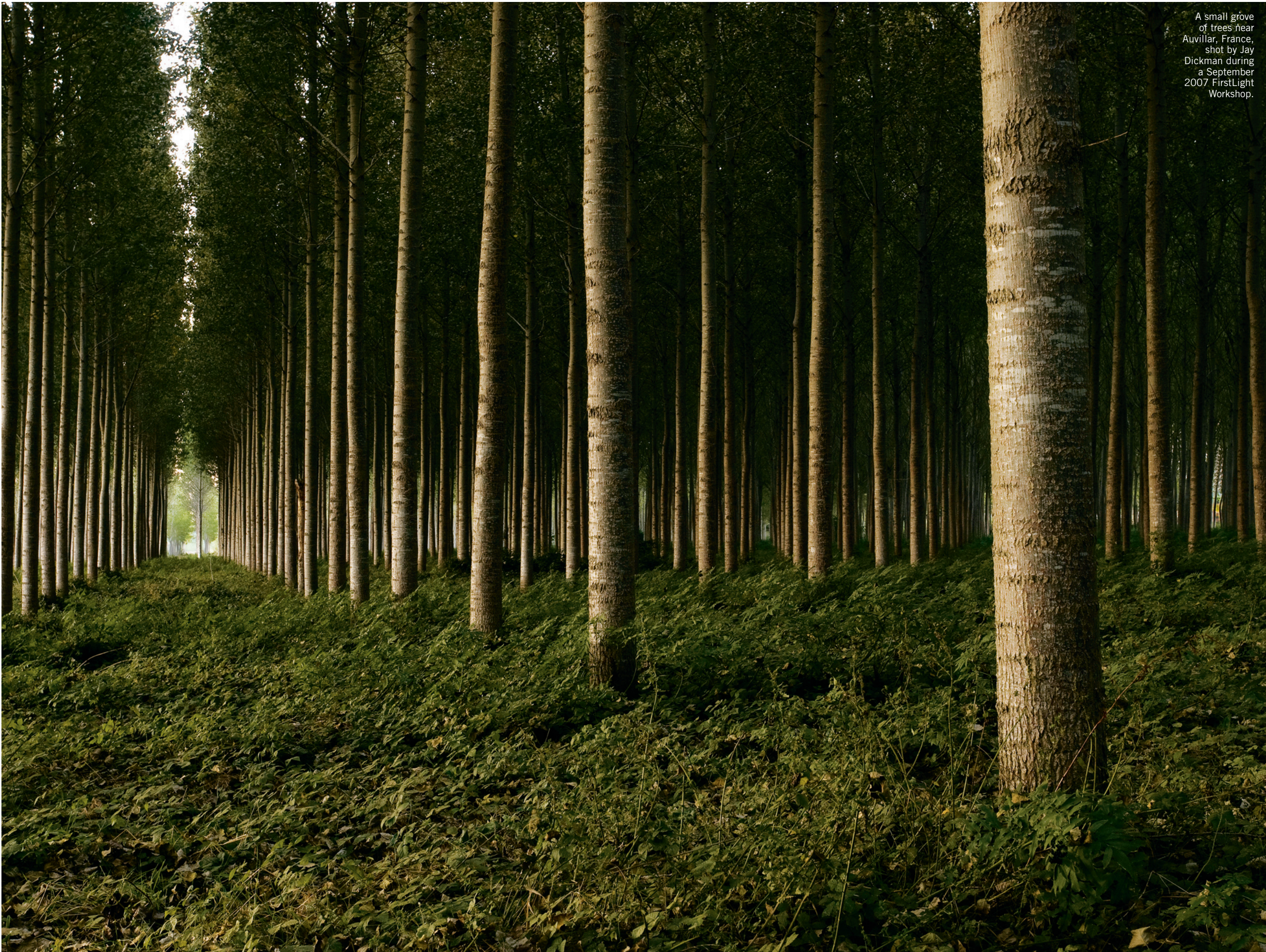
A small grove of trees near Auvillar, France, shot by Jay Dickman during a September 2007 FirstLight Workshop.

Jay Dickman and the other instructors of the FirstLight Workshop want participants to spend their time focusing on technique, not scouting around for a subject to shoot. Each student works closely with an instructor/editor to choose pre-scouted “assignments” guaranteed to get them shooting. Rather than limiting the visual experience, these assignments help them achieve more, and faster. Dickman explains, “The FirstLight photographer is able to focus on the photographic process during the week, which I find enables greater growth and confidence for their own travel/photography goals.”